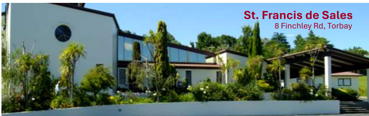
St. Francis de Sales 8 Finchley Rd, Torbay