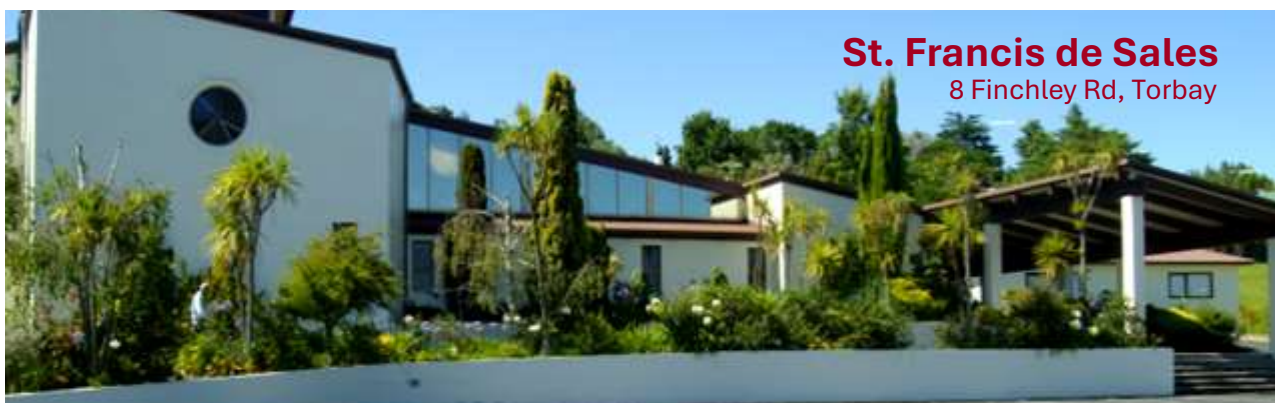
St. Francis de Sales 8 Finchley Rd, Torbay