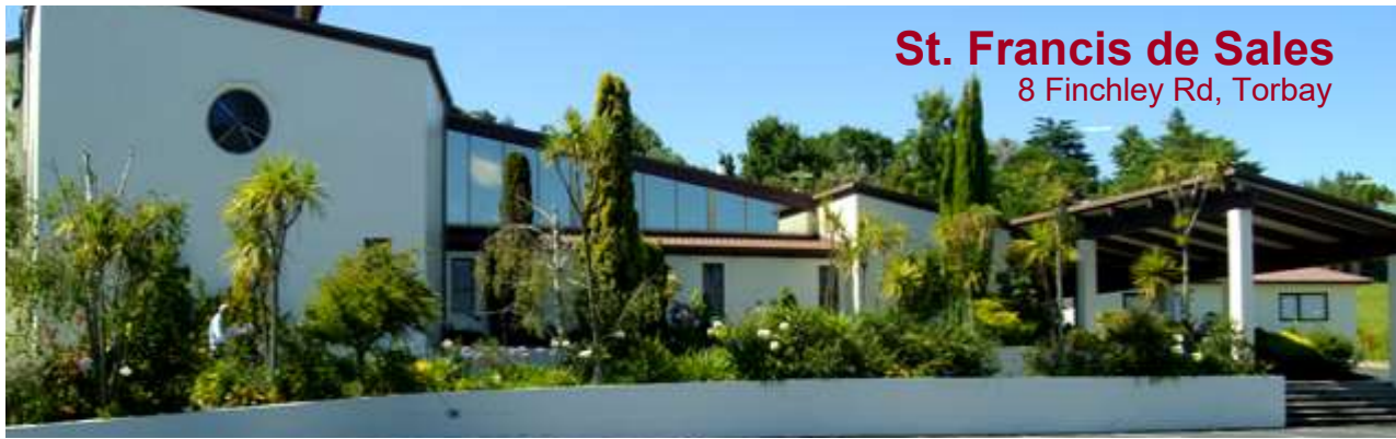
St. Francis de Sales 8 Finchley Rd, Torbay