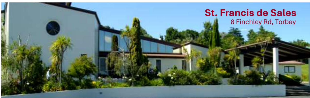
St. Francis de Sales 8 Finchley Rd, Torbay