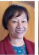
Tusi Hedditich Hospitality